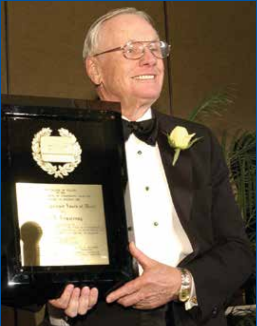
Neil Armstrong receives ACEC's Distinguished Award of Merit.