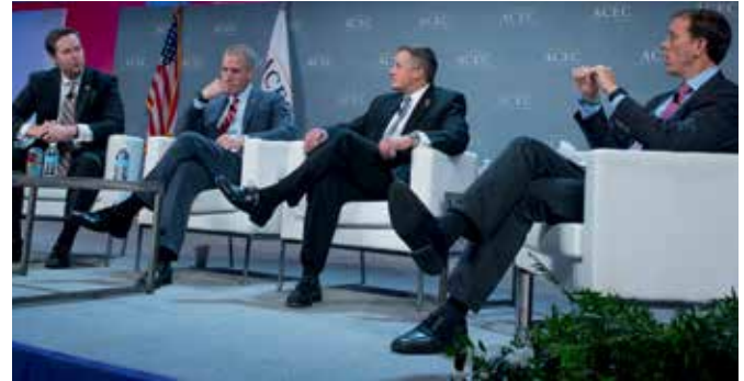
Politico Founder Jim VanderHei (right) and (left to right) Representatives Rodney Davis (R-IL), Sean Patrick Maloney (D-NY), and Bruce Westerman (R-AR) at the 2016 Annual Convention.