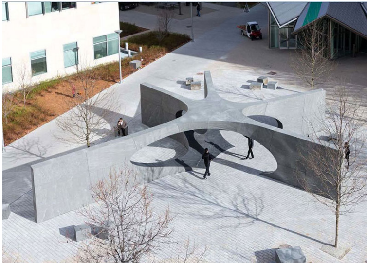
2016 Grand Conceptor Award: Ochsendorf, DeJong and Block, LLC, Consulting Engineers. Sean Collier Memorial Cambridge, Massachusetts

A completed entry form must be received at The Engineering Center by 5:30 PM on October 4, 2016. Use the attached entry form. Download additional forms and the Submission instructions and FAQs at http://bit.ly/ACECMA-EEA-2017 .