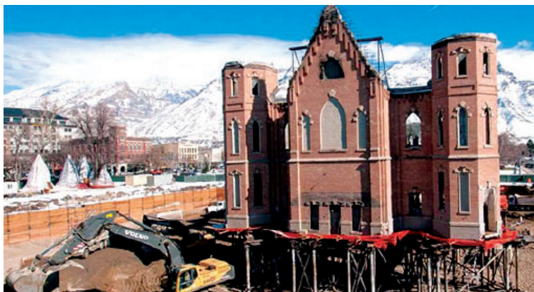
2015 Grand Conceptor Award: GEI Consultants, Inc. Provo Temple Underpinning Provo, Utah

Projects entered in the competition may have been executed anywhere in the world. Research and Studies or Surveying and Mapping projects must have been publicly disclosed by the client between Nov. 1, 2013 and Oct. 31, 2015. Construction of projects (with the exception of Surveying and Mapping Technology) must have been substantially completed and ready for use between Nov. 1, 2013 and Oct. 31, 2015.