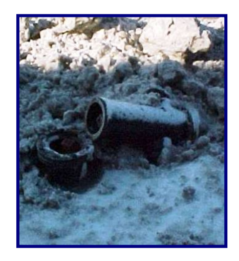
Broken or buried hydrants pose a significant public safety risk.

Continual maintenance (i.e., valve exercising, flow testing, general repairs, etc.) and replacement of fire hydrants is essential for effective fire protection and to avoid problems caused by frozen or buried fire hydrants during the winter months. Fire hydrant maintenance and repair is an essential part of annual