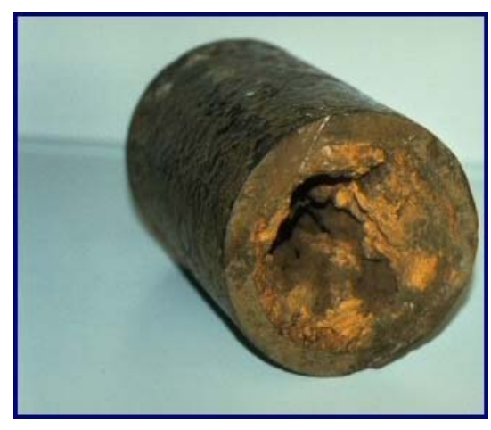
Severely tuburculated pipe can harbor bacteria and put public health at risk.

Continual maintenance and rehabilitation of the entire drinking water infrastructure—from source to tap—is needed to protect the public from waterborne disease. Failure to maintain the quality of water source areas, properly treat drinking water, maintain water storage tanks and facilities, and properly maintain distribution and transmission water mains can cause illness, disease, and even death to the unsuspecting and most vulnerable drinking water consumers.