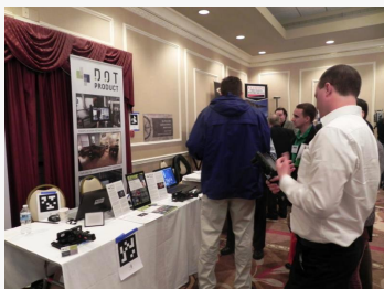
Convention attendees interacting with exhibitors.