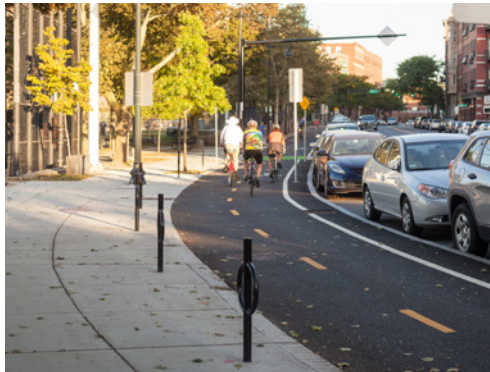
Bicycle lanes along Commercial Street in the North End separate bicycle and auto traffic.

The Connect Historic Boston Bike Trail extends 1.4 miles from Atlantic Avenue along Commercial Street, Causeway Street, and Staniford Street to Cambridge Street. During Phase One, a grade-separated, two-way protected cycle track was constructed along Staniford Street, Causeway Street, Commercial Street, and