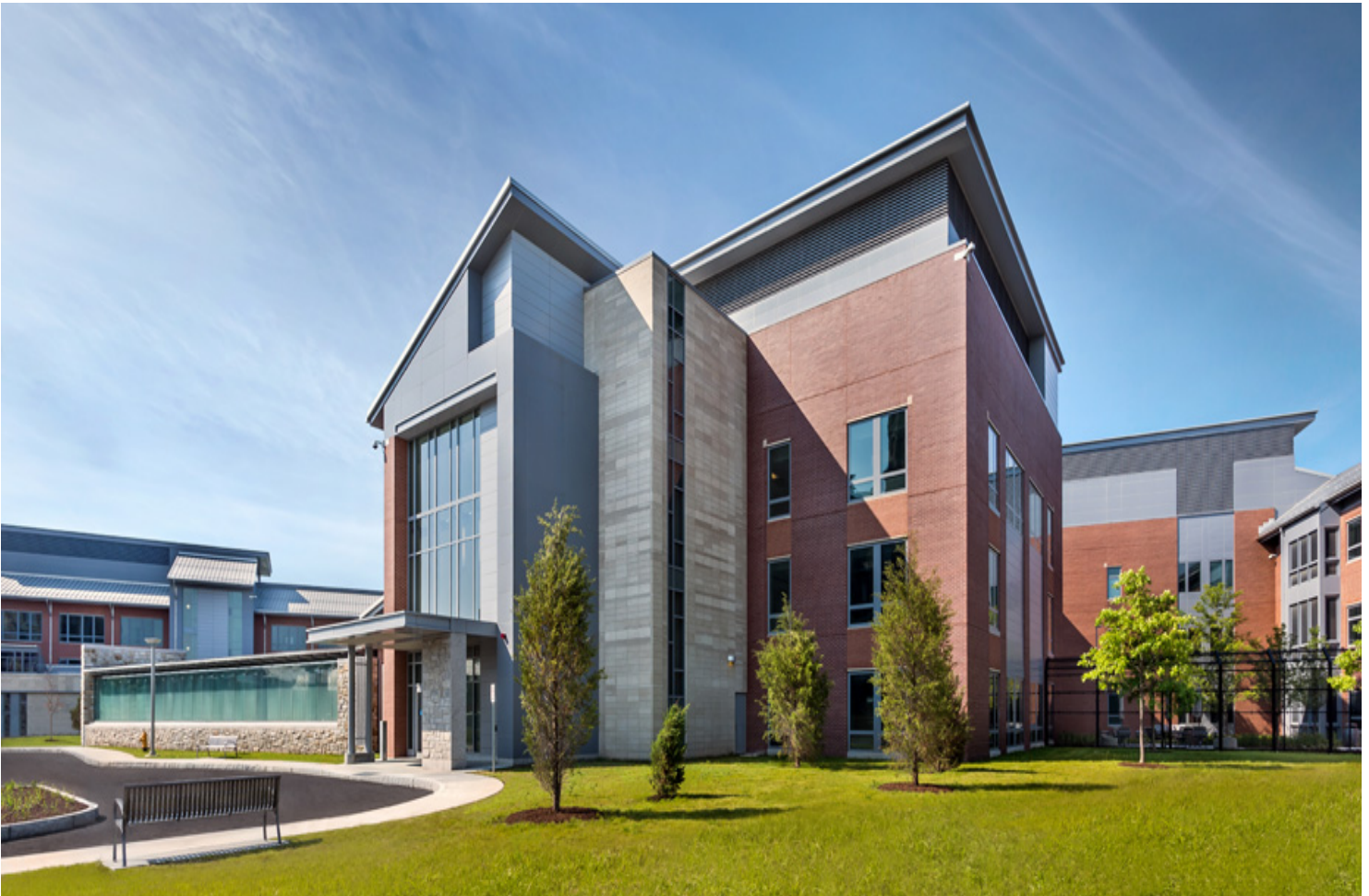
Worcester Recovery Center & Hospital Worcester, MA

Executive Office for Administration and Finance