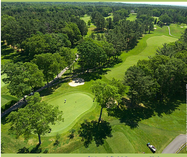
Supported by The Engineering Center Education Trust Staff

From South/Cape: Take Route 3 North to Exit 11. Turn right at top of ramp, then left onto Lincoln St approximately 100 ft. from ramp. Follow Lincoln Street (speed limit is 30mph strictly enforced) to fork in the road at large white fence. Bear right at fork onto Walnut St. Continue to intersection of Moraine and Walnut and turn left. Clubhouse is on left.