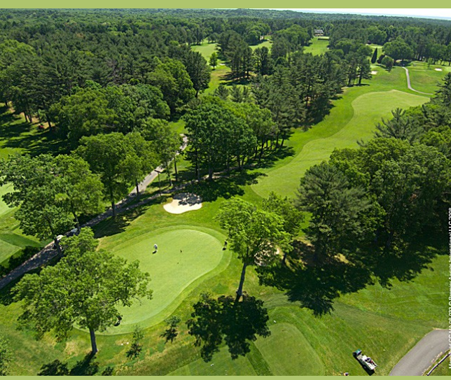
Supported by The Engineering Center Education Trust Staff

From South/Cape: Take Route 3 North to Exit 22. Turn right at top of ramp, then left onto Lincoln St approximately 100 ft. from ramp. Follow Lincoln Street (speed limit is 30mph strictly enforced) to fork in the road at large white fence. Bear right at fork onto Walnut St. Continue to intersection of Moraine and Walnut and turn left. Clubhouse is on left.