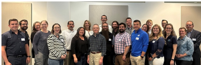
Odyssey Leadership Class of 2023 with ACEC/MA Leaders

Here's Your 7/20/23 Issue of ACEC/Matters