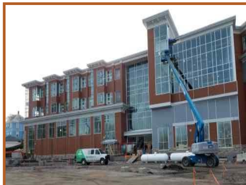
Billerica Memorial High School