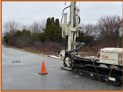
New Boston Street Bridge Over MBTA Track