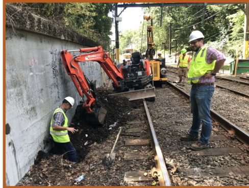
Newton Highlands MBTA Green Line Subway Station