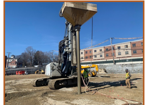
Public Safety Facility