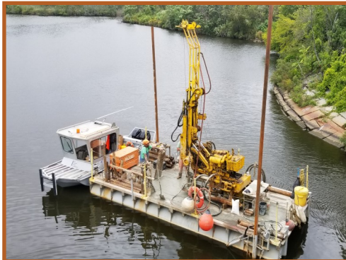
Mystic River Boardwalk