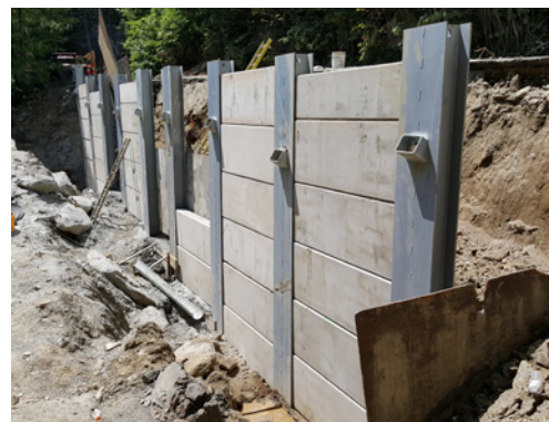
Lagging wall consisting of pre-cast concrete wall panels and soldier piles stabilize the embankment.

The repair of Black Brook Road was important to the town, surrounding communities, and emergency response services within Savoy. Rebuilding and restoring Black Brook Road provided social, economic, and sustainable benefits to the town, but the social considerations were the most critical. The town needed the road fixed to restore this vital connection between Savoy and neighboring towns that was severed