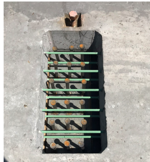
Shear studs installed on the existing beams at breakout of the precast deck panels.

The construction sequence was accelerated to maintain one westbound lane of traffic on the bridge at all times since a City fire station is located on the east side of the bridge. First, the