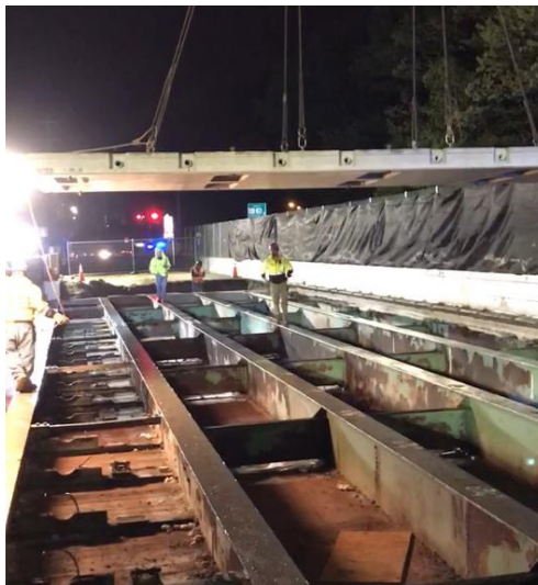
Lowering the pre-cast deck panels into place on the existing beams.

The project was scoped as a preservation project with the concrete deck to be replaced and the steel superstructure painted. Minor work was proposed for the substructure including replacing the abutment backwalls and modifying the "U-back" wingwalls to construct crash tested bridge railings. The proposed structure was designed using the American Association of State Highway and Transportation Officials (AASHTO) Load and Resistance Factor Design (LRFD) Bridge Design Specifications and MassDOT's Bridge Manual. The proposed bridge also includes two lanes of traffic, however, the curb to curb width was reduced to 38 feet with an 8-foot sidewalk on the north side.