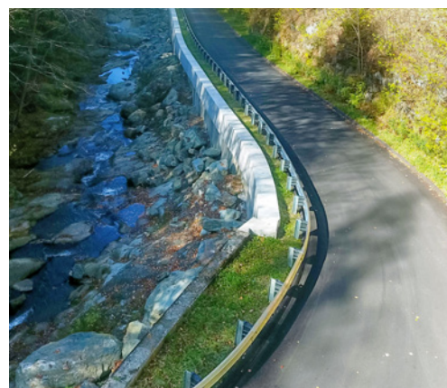
Restored roadway and supported embankment renders it resilient against climate-change induced extreme storms.

by storm damage; reduce the lengthy travel time to the store, nearby restaurants, health services, work; and, more importantly, reduce the response time of detoured emergency vehicles. With many residents aged over 60, waiting 45 minutes for help to arrive is unacceptable and life-threatening. This reconnection project restored emergency and routine access to residents in previously cut-off areas of town.