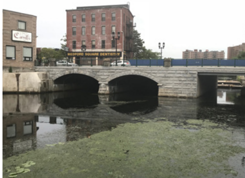
New arch spans and granite on upstream face makes the bridge an attractive component of the adjacent Medford Historical District.

Traffic volumes are very high since Main Street leads into Medford Square with an Annual Average Daily Traffic of approximately 42,000 vehicles. A temporary bridge was constructed to allow for two lanes of rush hour traffic in each direction. The temporary bridge was installed to the east (downstream side) of the bridge and