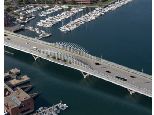
Rendering of final bridge design with existing Charles River Dam in lower left

A 285 ft. long by 33 ft. high architectural trellis will be constructed in barrier/planters that will mark the center of the navigation channel crossing and will extend up to 26 ft. over the bicycle lane and widened sidewalk to provide partial shade. The architectural trellis will be illuminated with accent lighting visible from the water and banks. The overlooks, benches, trees, information panels and the architectural trellis will create a unique destination that is separated from vehicular traffic and accessible for use by people of all ages and interests.