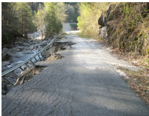
Post-Irene washout of sections of Black Brook Road rendered it nearly impassable.

With the steep roadway embankment susceptible to scour, a conventional cast-in-place concrete wall system was not feasible. Weston & Sampson's innovative stabilization design