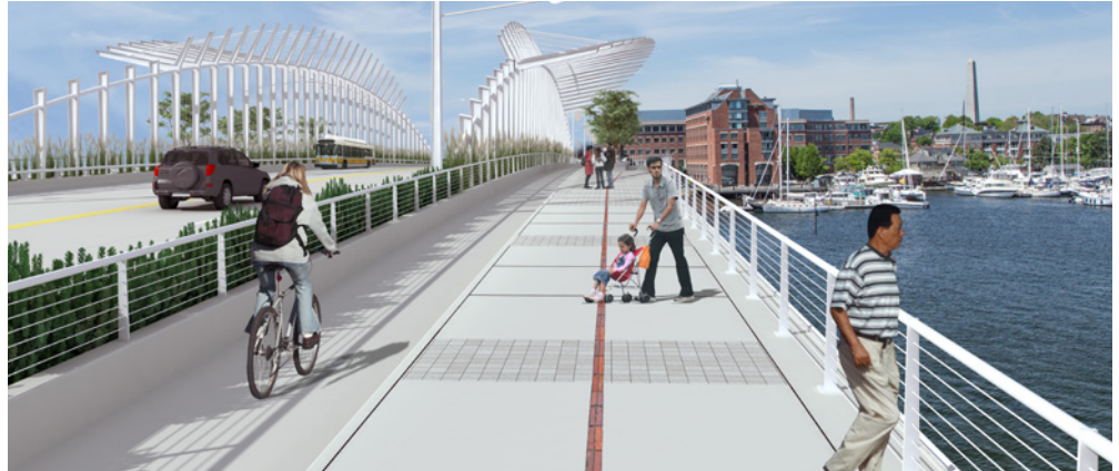
Rendering of bridge design on the pedestrian walkway facing Charlestown end of bridge.

The replacement superstructure requires that it be constructed in place and be able to support cantilevers that could be added later to support the sidewalks and the overlooks on the main span. The resulting design consists of four torsionally rigid trapezoidal steel box girders with