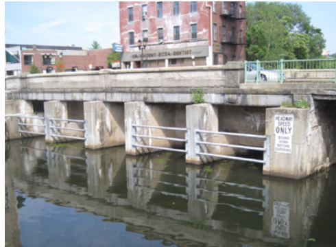
An earlier road widening in the 1920s had obscured the arched spans of the original bridge.

While the bridge is not itself listed on the Historic Register, it is a contributing element to the Medford Historic District. The project