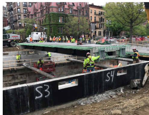
Rapid placement of Prefabricated Bridge Units minimized traffic disruptions.

A unique feature of the crossing is that the deck carries compression from side walls. In effect, the bypass functions as a tunnel section. Therefore, during demolition, without temporary support, existing abutment walls, which by then were strengthened by new cast-in-place (CIP) facing walls, would have to act as cantilever walls from their base. Review of the existing structure indicated that reinforcement was insufficient to provide strength for cantilever behavior. The design package included loads and details for