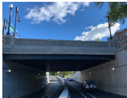
Reconstructed bridge replicated historic design features, while expanding clearance for underpass traffic.

temporary struts to be placed before demolition. Plates were embedded in the CIP-facing walls to accommodate placement of struts.